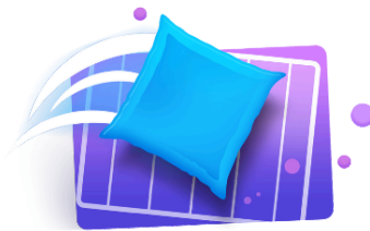
GOING THE DISTANCE ENGINEERING