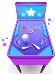
PINBALL HEROES TECHNICAL

Hudson Middle School 1300 Carmichael Road Hudson, WI March 2nd, 2024