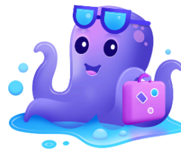
MAKING A SPLASH EARLY LEARNING