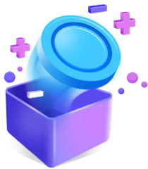
SO EXTRA IMPROVISATIONAL