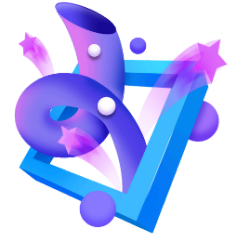
IN MOTION FINE ARTS