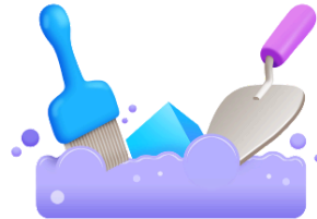
BLAST FROM THE PAST SCIENTIFIC